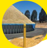
Spills (Diesel / Hydraulics)